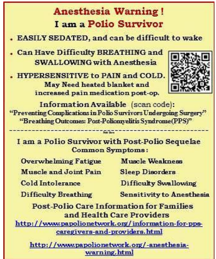
Scan Code for Smart Phone Without Name and Specific Symptoms